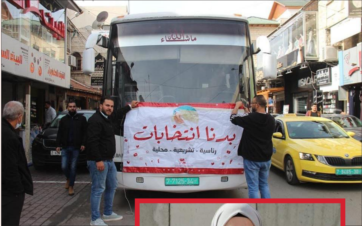
The Social Media Bus

Further, the youth conducted three social media buses in Tulkarm, Jenin and Hebron, where they toured cities and villages to open dialogues with the citizens and enthruse them to register to the elections and be part of the upcoming electoral process. The discussions were interesting since the youth asked about the willingness of the citizens to be involved in the elections and the importance of holding elections in Palestine. The reaction from the citizens were interesting and promising.