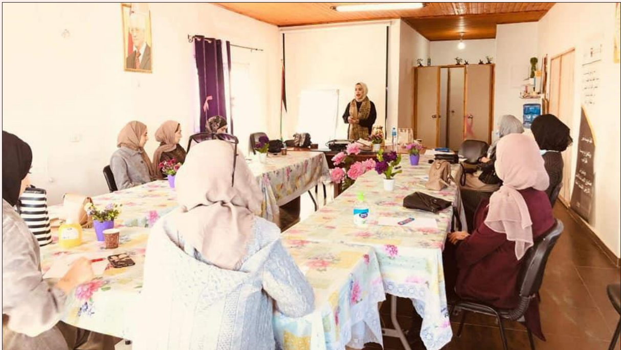
One of the youth participants leading a session on the freedom of religion and belief

This cooperation between the parties provides a strategic added value, the opportunity for mutual learning, regional exchange and enhanced capacity. Throughout this project, the PCPD along with 50 youth were able to produce a booklet on FoRB in Palestine and the peaceful mechanism to encounter discrimination.