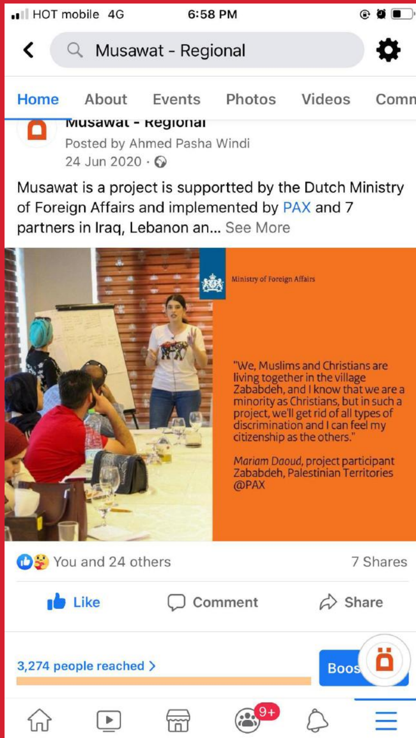
One of the posts on facebook reached to 3274 persons

PCPD along with its youth groups prepare these You tubes together and when they are finalized, we all work together to spread them over social media and share them with a big number of friends.