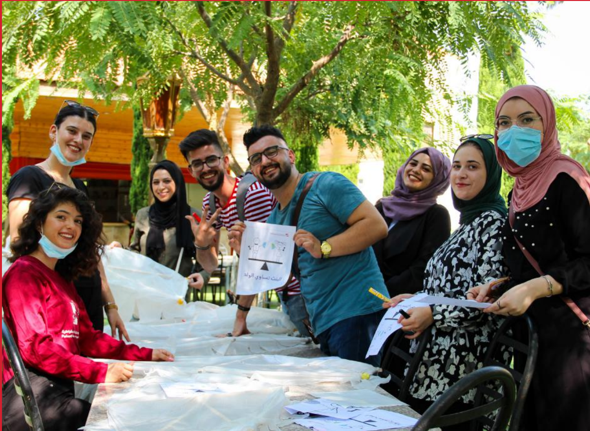
During one of the initiatives spreading the concept of equality entitled: the girl equals the boy