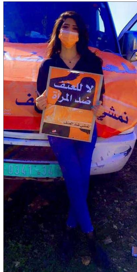
Youth holding slogans during the campaign Let's Walk Against Violence

One of the most important issues is violence against women represented mainly in honor killings, harassment and discrimination between boys and girls, women and men. What is called "honor killing" of women represent a topic especially taboo in the society. This can be explained in part by social and cultural norms, lack of knowledge on women's rights and international standards and a patriarchal social structure that tends to systematically disempower and discriminate against women.