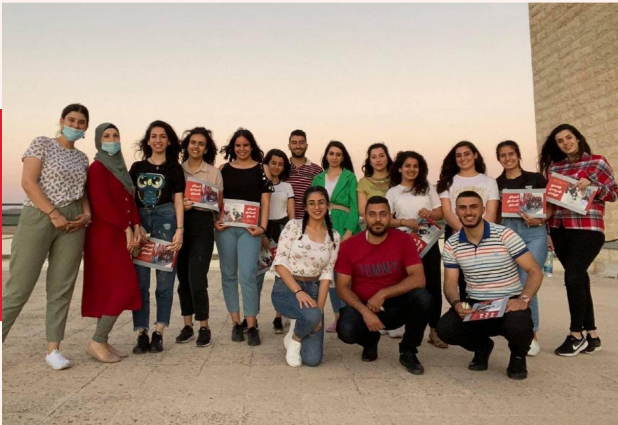
A group of supporters during one of the field initiatives