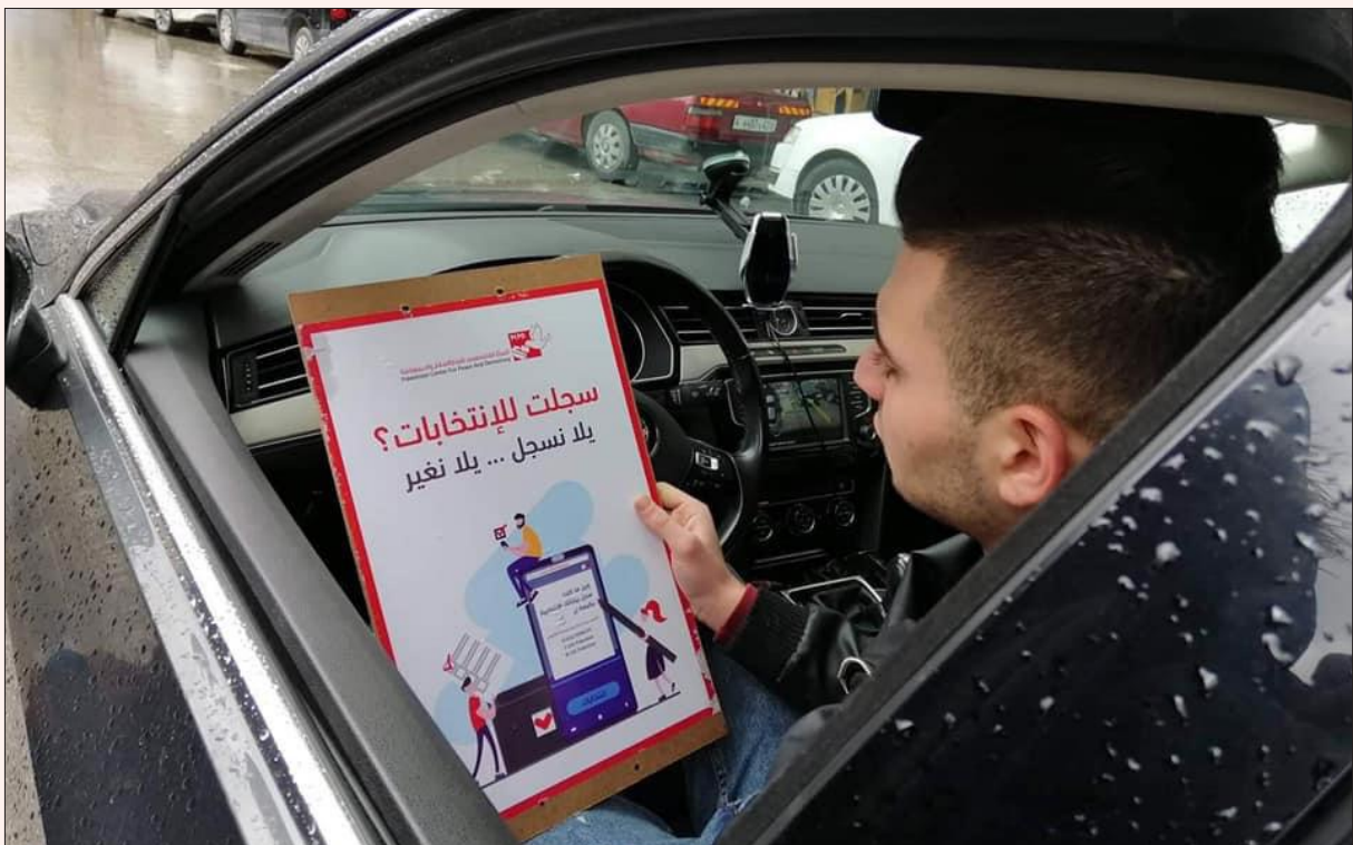
PCPD youth distribute posters to citizens asking them to register to the elections, as a first step towards the right to elect when the elections do take place.

In Palestine, no legislative elections have been organized since 2006. Since then, the fragmentation of the political and national identity has deepened, particularly through the disunity between Hamas in Gaza and Fatah in the West Bank. Political parties in Palestine do not evolve or flourish under the current political parties' De facto, and their accountability to the citizens is minimal. This is not only the result of the fact that there are no free and fair elections on a regular basis. The vast majority of decisions made by the Political Bureau for the Central Committees does ultimately not influence the real decision makers: The Government and the President.