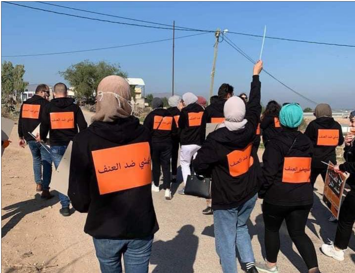
Youth holding slogans during the campaign Let's Walk Against Violence

Another related issue is the patriarchal society in Palestine that prefers women to be confined in the private sphere, and who put many obstacles in front of those who are activists. The clans are becoming more opposing to women rights and they are waging campaigns against CEDAW.