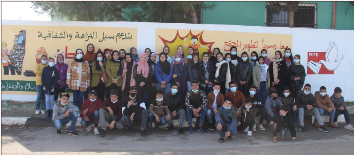
Integrity club members during an Integrity Day in Al-Aqaba

In Palestine, no legislative elections have been organized since 2006. Since then, the fragmentation of the political and national identity has deepened, particularly through the disunity between Hamas in Gaza and Fatah in the West Bank. Political parties in Palestine do not evolve or flourish under the current political parties' De facto, and their accountability to the citizens is minimal. This is not only the result of the fact that there are no free and fair elections on a regular basis. The vast majority of decisions made by the Political Bureau for the Central Committees does ultimately not influence the real decision makers: The Government and the President.