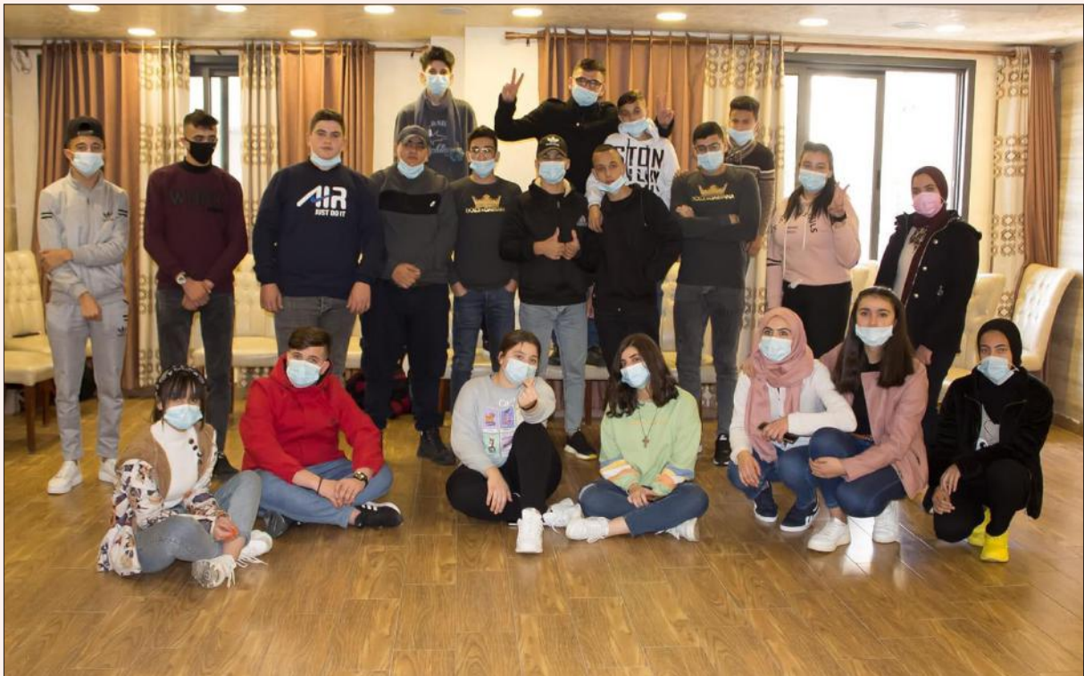
Leaders of Integrity clubs in training