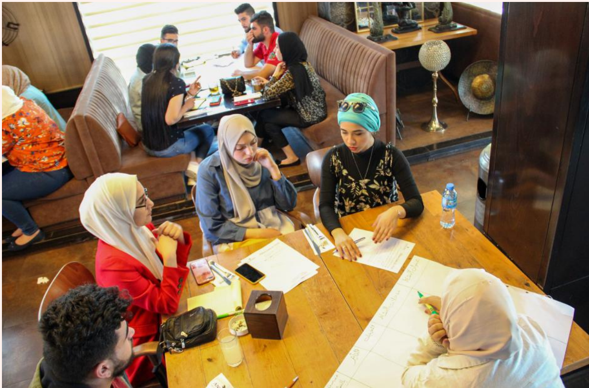
Youth in one of their brainstorming sessions

PCPD promotes a genuine peace based on UN Resolutions and the Palestinian Declaration of Independence PDI leading to the establishment of an independent democratic Palestinian state on the borders of 1967 beside the state of Israel; with a focus on human security, conflict resolution mechanisms based on international legitimacy, thus reviving positive peace through building the capacity of youth and local actors to promote tolerance and reduce prejudices. A society that enjoys peace and security, where conflicts are dealt with through non-violent approaches; human rights are respected and citizens feel safe and secure. The political participation of women in processes relating to peace and security is crucial for international peace and security. In Palestine, young women and men need to be part of the negotiation, peace and reconciliation processes; need to be active in the public sphere, in accordance to the PDI and the resolutions of the UN Security Council Resolutions, mainly 1325. To pursue this, we believe in the inclusion of women in political and peace processes.