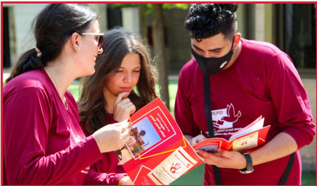
Youth in the Feminist Youth Forum discussing the Charter during one of the field initiatives

Under this program, PCPD is promoting and increasing women's political empowerment and participation, representation, leadership and influence in all spheres of their lives; increase women's opportunities to have their voice heard and participate in the political and public life as well as in the decision-making processes. Within this sphere, a group of young feminists produced a Feminist Political Charter ; that calls for a safe space for young women and men.