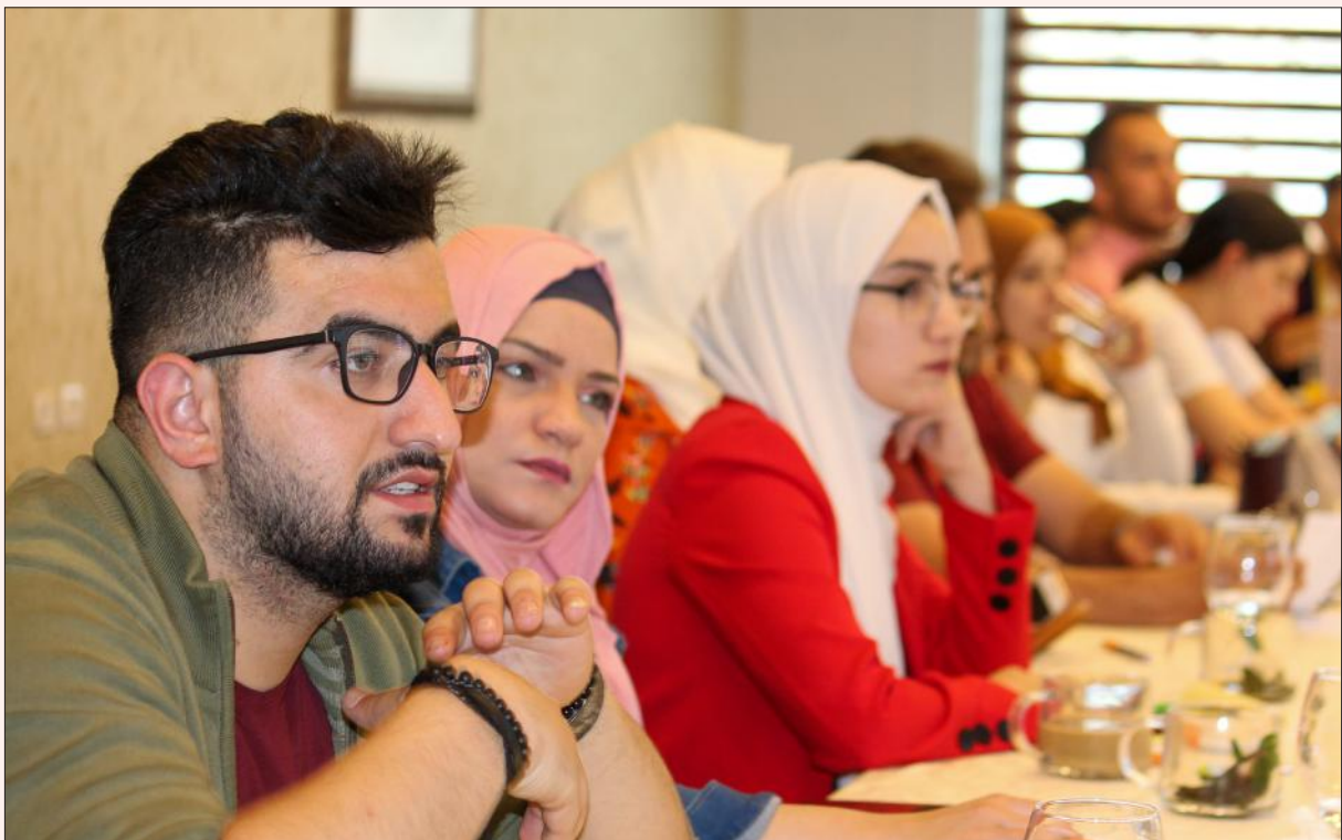
Youth in one of the training sessions

This cooperation between the parties provides a strategic added value, the opportunity for mutual learning, regional exchange and enhanced capacity. Throughout this project, the PCPD along with 50 youth were able to produce a booklet on FoRB in Palestine and the peaceful mechanism to encounter discrimination.