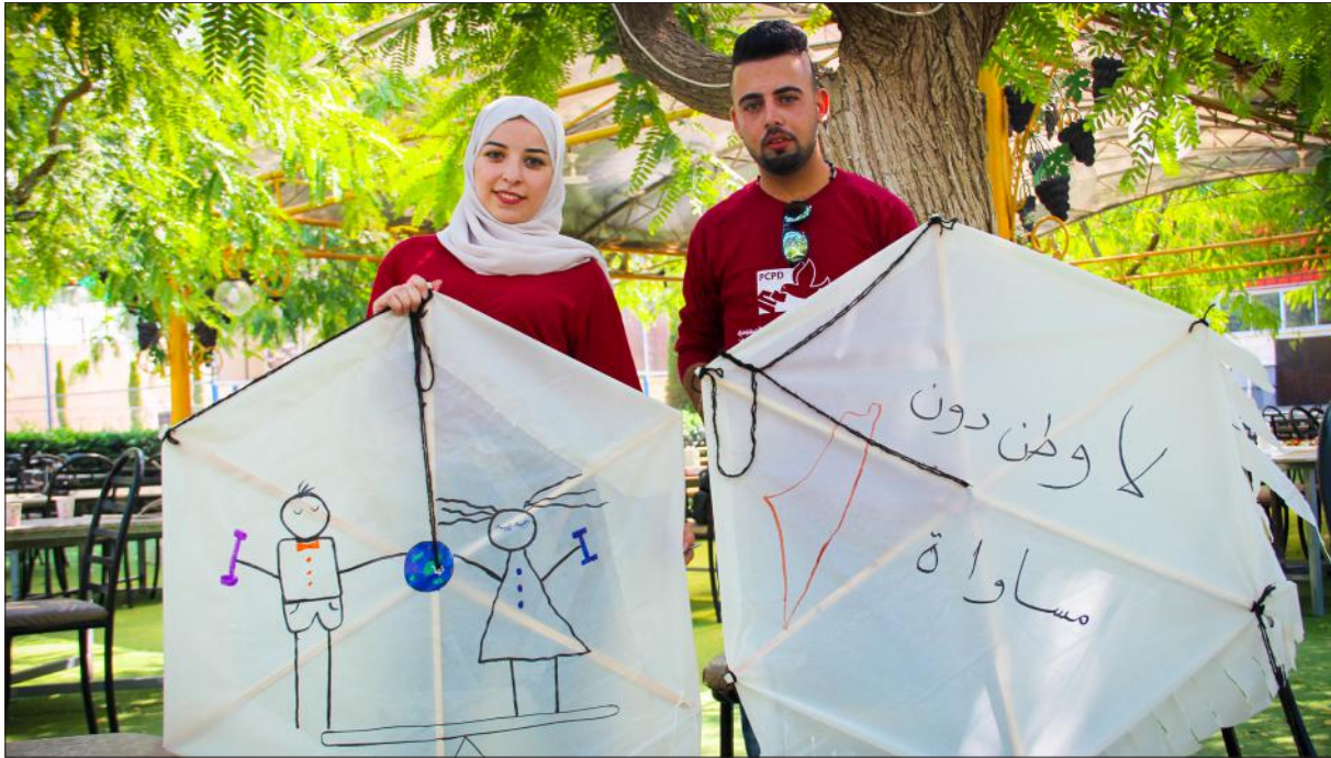
During one of the initiatives spreading the concept of equality entitled: the girl equals the boy

Marking 16 Days of Activism Against Gender Based Violence, through an initiative entitled: Let's Walk Against Violence . The idea was to do a march in order to attract attention to the violence that is taking place against women. The second march was planned to attract a bigger number of youth and to do the walk in areas that are at risk of confiscation, mainly the Jordan Valley, and as a result, PCPD conducted this initiative on the 10th December in Bardala in the Jordan Valley, where throughout the initiative, the youth met women from there, listened to their experiences and shared their own views towards the future of the Jordan Valley in the Deal of the Century, and also the ladies in the village of Bardala have given a detailed idea about their suffering not only from the Israelis, but also from their husbands, fathers and brothers; a suffering that was doubled during Corona time since men spend more time in houses and women are violated by them.