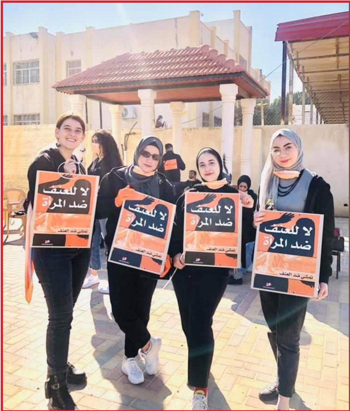
Youngsters spreading the feminist perspective

Nowadays, PCPD wants to revive the Palestinian Gender Sensitive Constitution, in order to spread gender equality between young women and men, address circumstances that may limit women's enjoyment of equal rights and opportunities, approach the Official Palestinian Committee and pressurize them to convene and work on a Fair Constitution for Palestine through the implementation of a variety of innovative initiatives, mainly sits ins, street activities meeting the public; preparing a Newsletter and Position Papers and publishing these in different media channels.