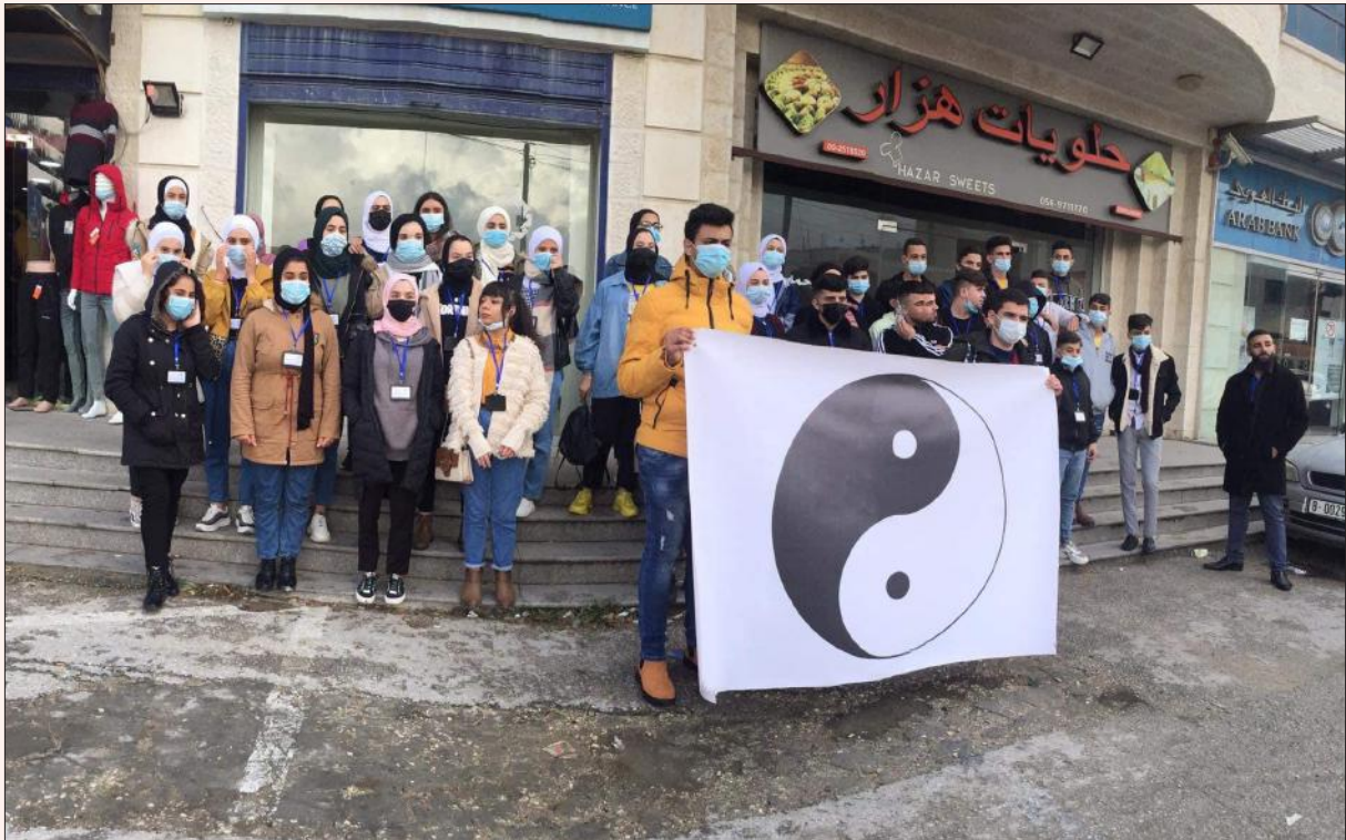
During one of the initiatives of the Integrity clubs in Salfet under the title: White of Black

Under the Shine project, PCPD is keen to spread the principles of integrity between young students outside the school rooms. PCPD was able to reach to the most marginalized areas in the West Bank, including Salfet and Tubas regions.