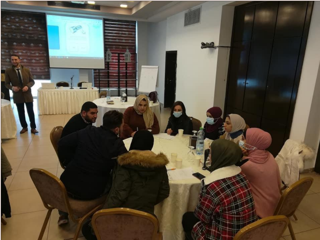
Youth planning to implement training workshops and meetings with CBOs to focus on the municipal elections of 2021

This project (funded by IFA) is implemented jointly with PAX.