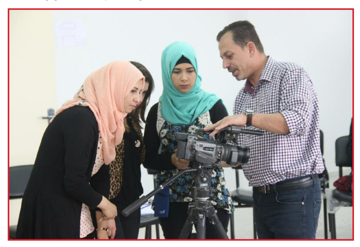
Youth are trained on shooting films for the sake of producing short films to promote their beliefs.

PCPD established a core group of confident and engaged young women and men, who desire progressive change in the public, political discourse, giving priority to political agendas. This was done through addressing a political development and democracy training program as well as training on social and classic media, with the purpose of developing a Rights Based Feminist Political Charter that will contribute to change in the public, political discourse and give priority to women engagement in the political agendas.