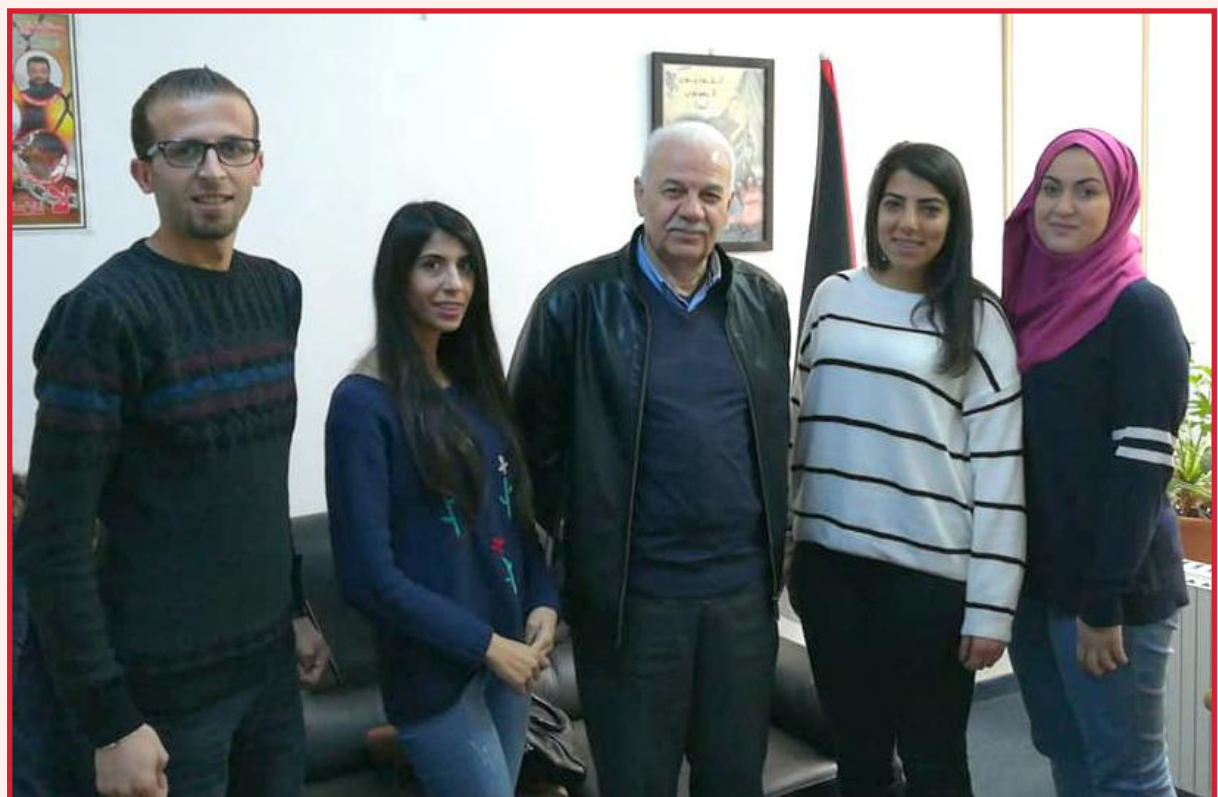
Youth meeting decision makers in the different cities of the West Bank