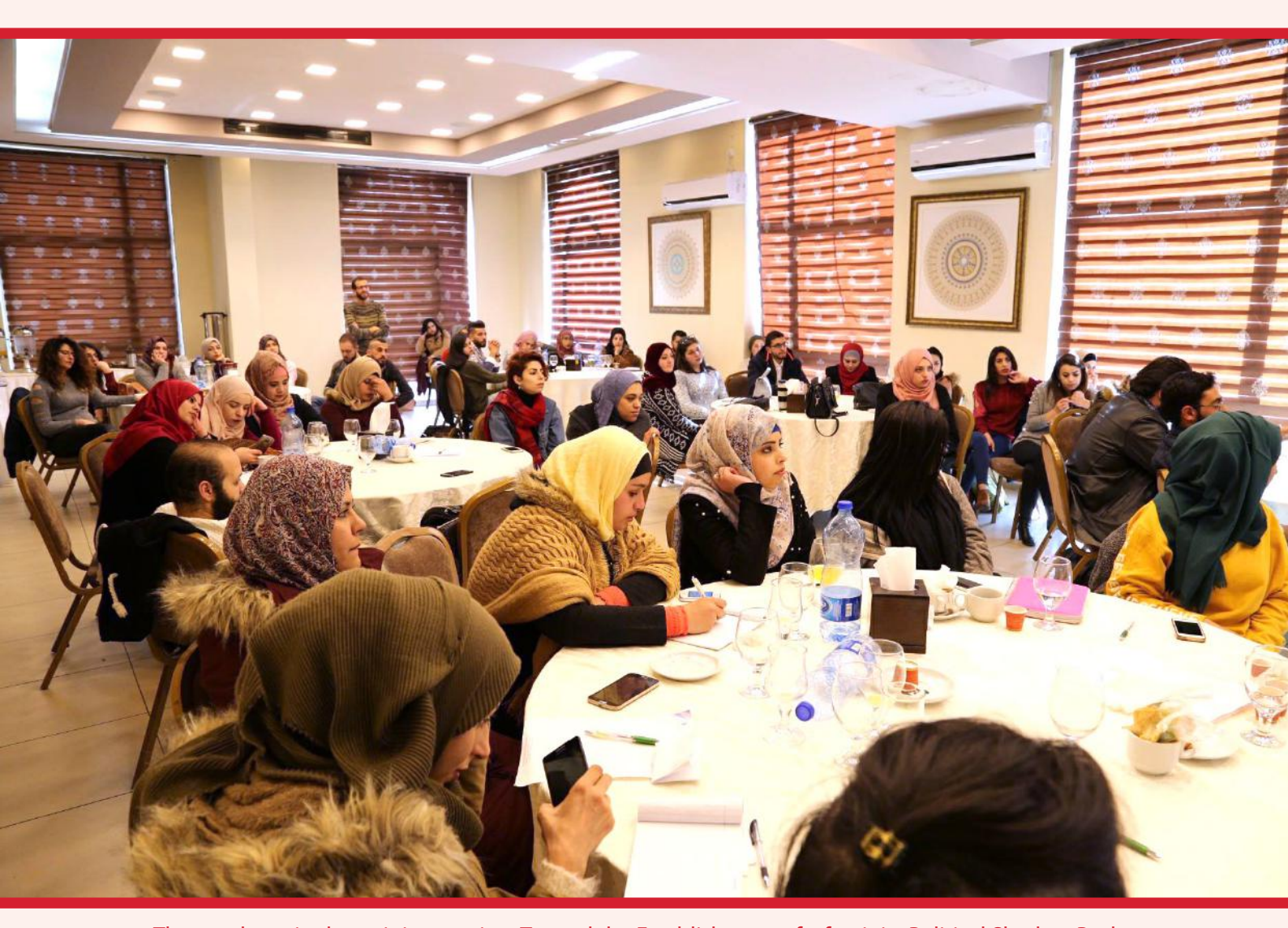
The youth are in the training session: Toward the Establishment of a feminist Political Shadow Body