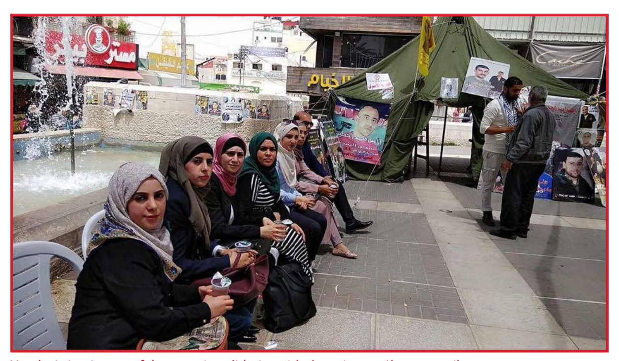
Youth sitting in one of the tents in solidarity with the prisoners' hunger strike

PCPD youth show solidarity during the prisoners' hunger strike, where they volunteered to join the solidarity tents, in order to be with the families of the prisoners during these difficult times. They raised slogans and talked to the citizens there, went out to the streets and conducted campaigns in the streets, thus challenging discriminatory practises that hinder young women to be activists in the public sphere.