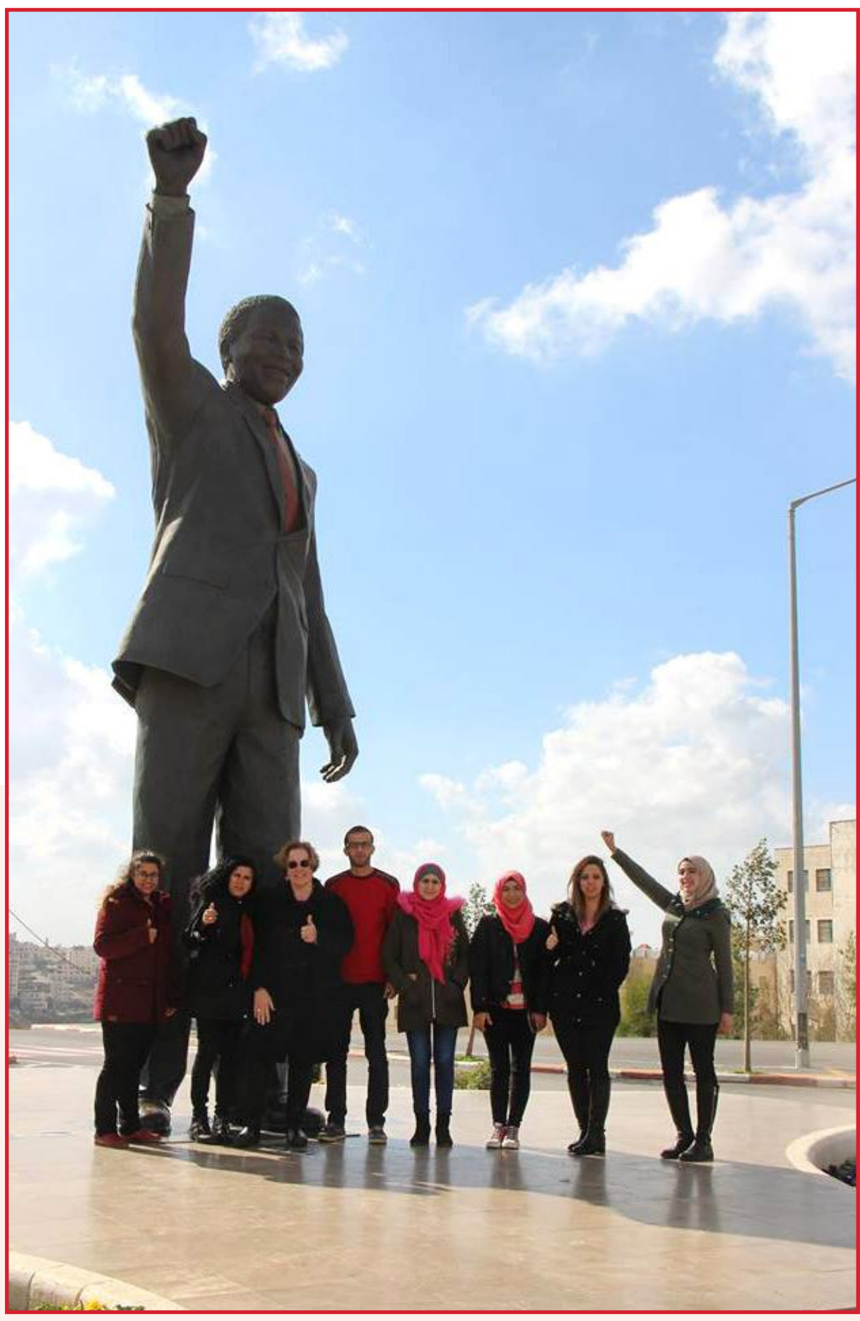
The PCPD standing in front of the monument of Mandella in Ramallah