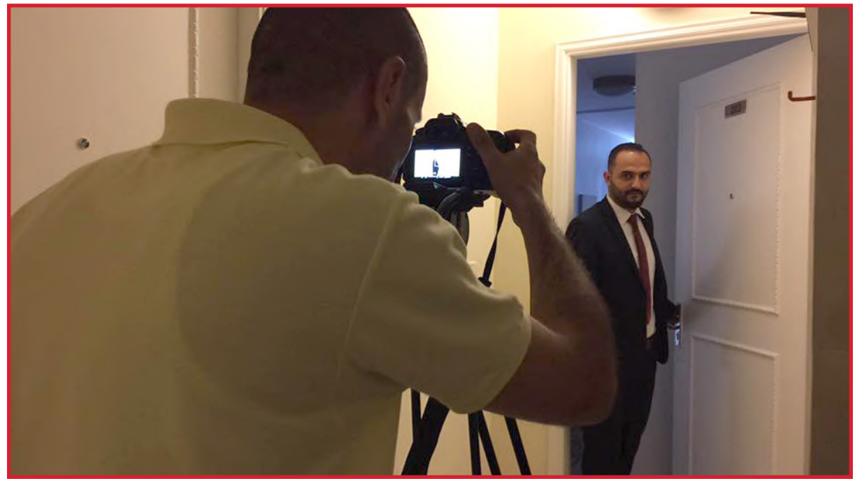
A picture during the film produced by the youth; entitled: No to discrimination between men and women in the wages. The film is the idea, shooting and act of the youth themselves.

The short films were screened in the local TV channels (Maan TV and Falastinyat) in addition to be posted on the facebook and on PCPD You tube. Further, these films were screened in 50 occasions in cooperation with 50 different CBOs. A discussion took place after each screening and recommendations for change were gathered by the core group who conducted these workshops. Throughout these screenings the PCPD reached 1061 youth from the different regions of the West Bank. Constructive discussions took place between the core group and the youth around issues of women's rights and equality in the Palestinian laws and how to be in line with the international legislations.