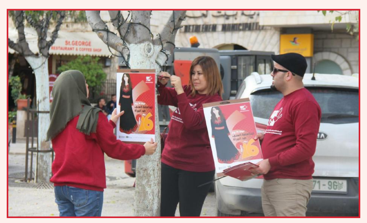
Youth hanging posters in the street to mark the 16 Days of Violence Against Women

PCPD marked 16 Days Activism Against Violence by a campaign entitled: "Do You Know?" The core group of young women at PCPD met on the 21st November to discuss the campaign and plan for it. They also prepared the printed material that they will be using during this campaign which aimed to shed the light to the importance of ending violence against women and demand for legislations that protect women against violence in all its forms and kinds. The proposed campaign was to go to the streets and meet the citizens and open with them discussions related to gender violence. The youth chose to introduce 16 topics related to the daily reality of young Palestinian women.