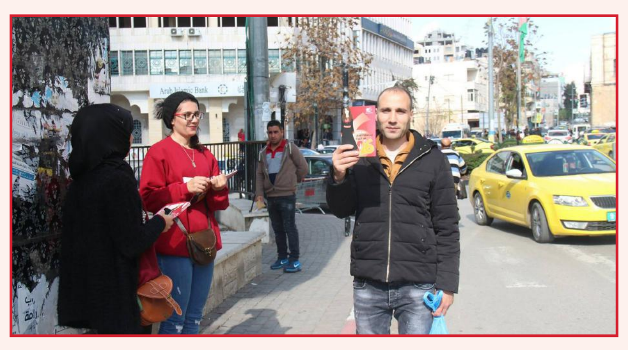
One of the citizens is glad to get a pamphlet from the youth and is proud to hold it in front of the camera