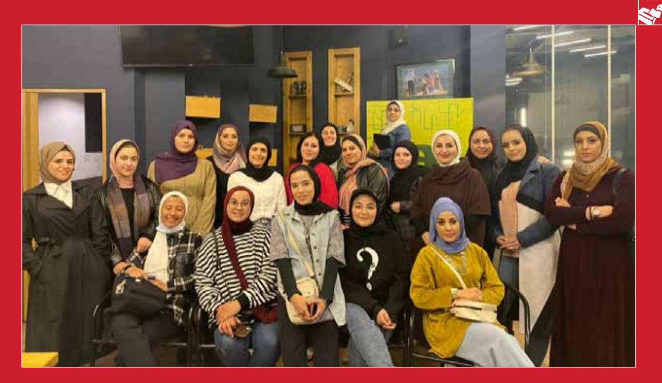
An exciting project called "Jame't Banat (the Girls' Gathering)" is a project that brings young women together to talk about their personal lives, the challenges that hinder them from being activists and the measures needed to empower them. This project is funded by ZFD.