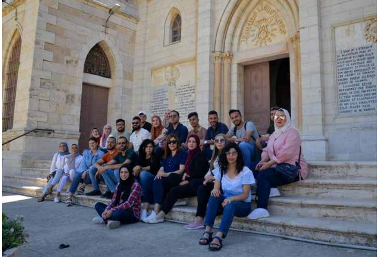
A visit to a catholic Convent in Artas village during the tour.

During the Musawat project, the youth also participated in the painting of a mural that represented the importance of the freedom of expression. This painting was a replica of the mural that exists on The Wall near Jenin and Hebron. The murals were painted through the cooperation of the local governments, youth activists, and representatives of civil society organizations and political figures.