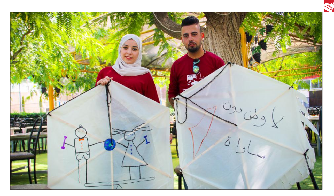
During one of the initiatives spreading the concept of equality entitled: the girl equals the boy

Marking 16 Days of Activism Against Gender Based Violence, through an initiative entitled: Let's Walk Against Violence. The idea was to do a march in order to attract attention to the violence that is taking place against women. The second march was planned to attract a bigger number of youth and to do the walk in areas that are at risk of confiscation, mainly the Jordan Valley, and as a result, PCPD conducted this initiative on the 10th December in Bardala in the Jordan Valley, where throughout the initiative, the youth met women from there, listened to their experiences and shared their own views towards the future of the Jordan Valley in the Deal of the Century, and also the ladies in the village of Bardala have given a detailed idea about their suffering not only from the Israelis, but also from their husbands, fathers and brothers; a suffering that was doubled during Corona time since men spend more time in houses and women are violated by them.