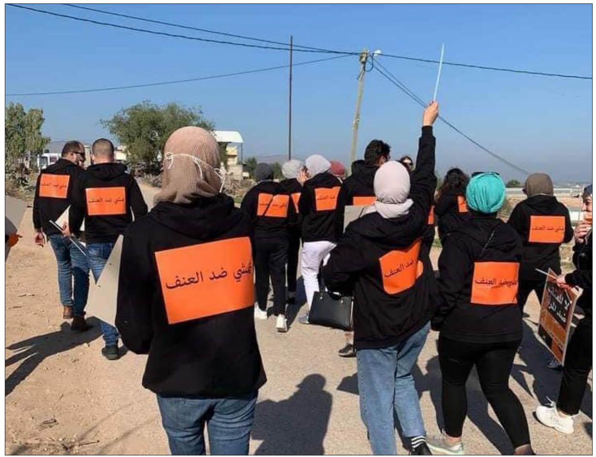
Youth holding slogans during the campaign Let's Walk Against Violence

Another related issue is the patriarchal society in Palestine that prefers women to be confined in the private sphere, and who put many obstacles in front of those who are activists. The clans are becoming more opposing to women rights and they are waging campaigns against CEDAW.