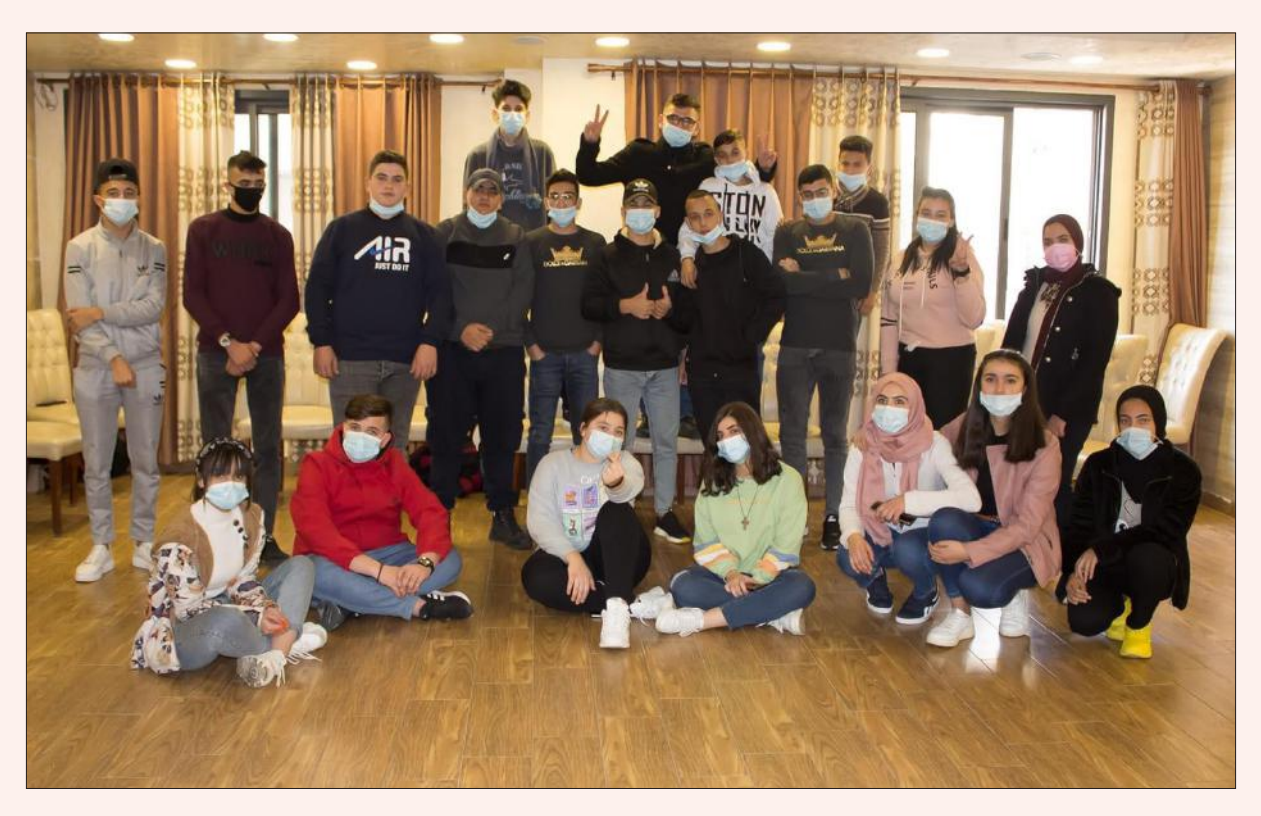
Leaders of Integrity clubs in training