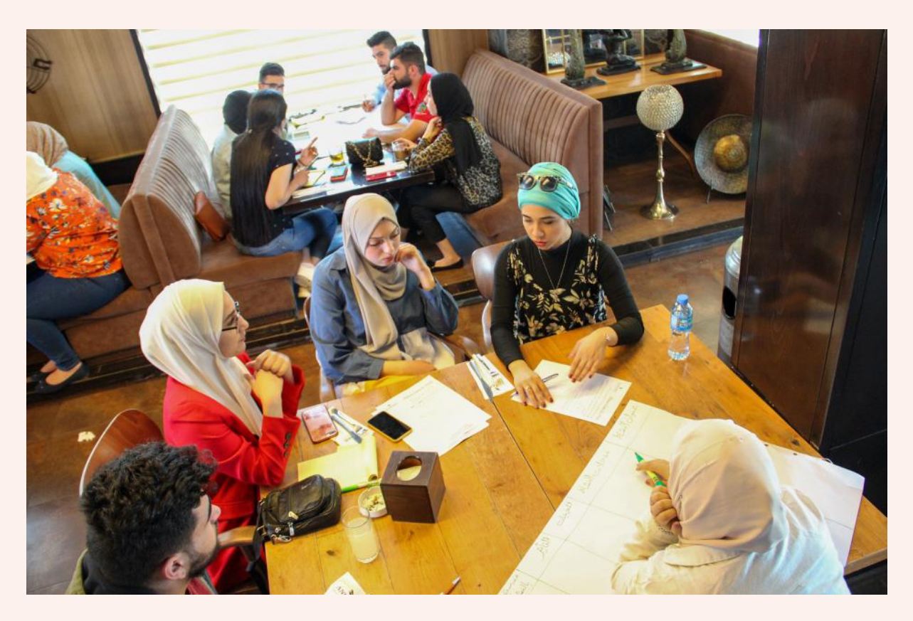
Youth in one of their brainstorming sessions

PCPD promotes a genuine peace based on UN Resolutions and the Palestinian Declaration of Independence PDI leading to the establishment of an independent democratic Palestinian state on the borders of 1967 beside the state of Israel; with a focus on human security, conflict resolution mechanisms based on international legitimacy, thus reviving positive peace through building the capacity of youth and local actors to promote tolerance and reduce prejudices. A society that enjoys peace and security, where conflicts are dealt with through non-violent approaches; human rights are respected and citizens feel safe and secure. The political participation of women in processes relating to peace and security is crucial for international peace and security. In Palestine, young women and men need to be part of the negotiation, peace and reconciliation processes; need to be active in the public sphere, in accordance to the PDI and the resolutions of the UN Security Council Resolutions, mainly 1325. To pursue this, we believe in the inclusion of women in political and peace processes.