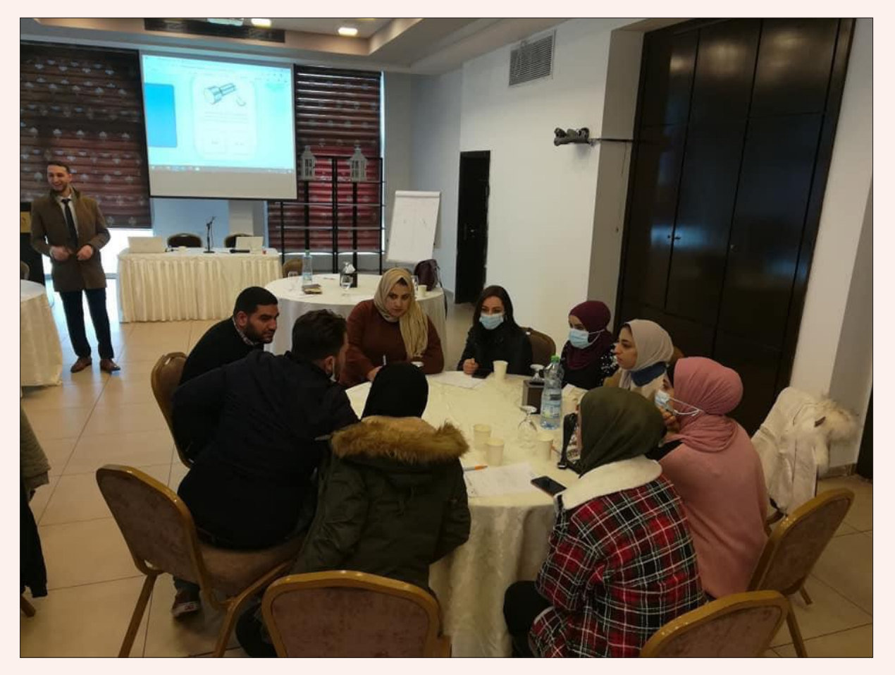
Youth planning to implement training workshops and meetings with CBOs to focus on the municipal elections of 2021

This project (funded by IFA) is implemented jointly with PAX.