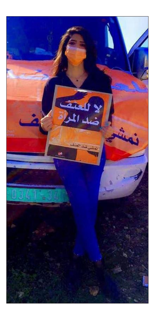
Youth holding slogans during the campaign Let's Walk Against Violence

One of the most important issues is violence against women represented mainly in honor killings, harassment and discrimination between boys and girls, women and men. What is called "honor killing" of women represent a topic especially taboo in the society. This can be explained in part by social and cultural norms, lack of knowledge on women's rights and international standards and a patriarchal social structure that tends to systematically disempower and discriminate against women.