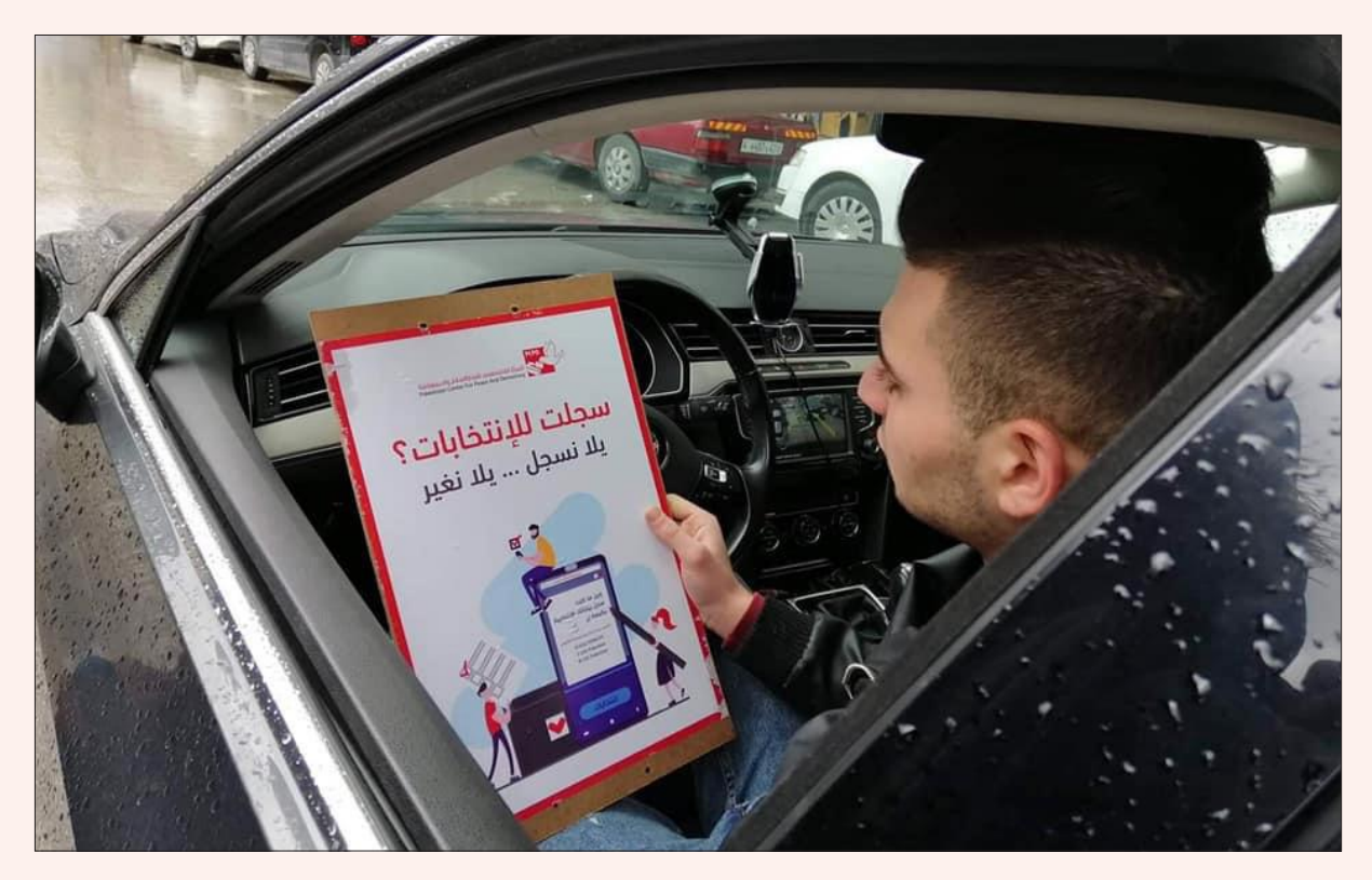
PCPD youth distribute posters to citizens asking them to register to the elections, as a first step towards the right to elect when the elections do take place.

In Palestine, no legislative elections have been organized since 2006. Since then, the fragmentation of the political and national identity has deepened, particularly through the disunity between Hamas in Gaza and Fatah in the West Bank. Political parties in Palestine do not evolve or flourish under the current political parties' De facto, and their accountability to the citizens is minimal. This is not only the result of the fact that there are no free and fair elections on a regular basis. The vast majority of decisions made by the Political Bureau for the Central Committees does ultimately not influence the real decision makers: The Government and the President.