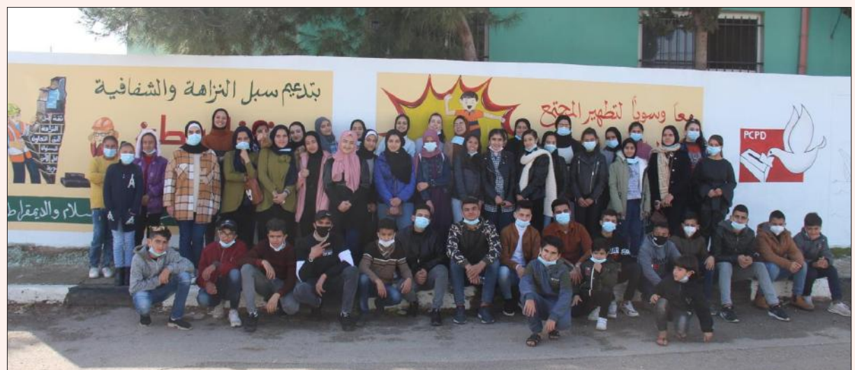
Integrity club members during an Integrity Day in Al-Aqaba

In Palestine, no legislative elections have been organized since 2006. Since then, the fragmentation of the political and national identity has deepened, particularly through the disunity between Hamas in Gaza and Fatah in the West Bank. Political parties in Palestine do not evolve or flourish under the current political parties' De facto, and their accountability to the citizens is minimal. This is not only the result of the fact that there are no free and fair elections on a regular basis. The vast majority of decisions made by the Political Bureau for the Central Committees does ultimately not influence the real decision makers: The Government and the President.