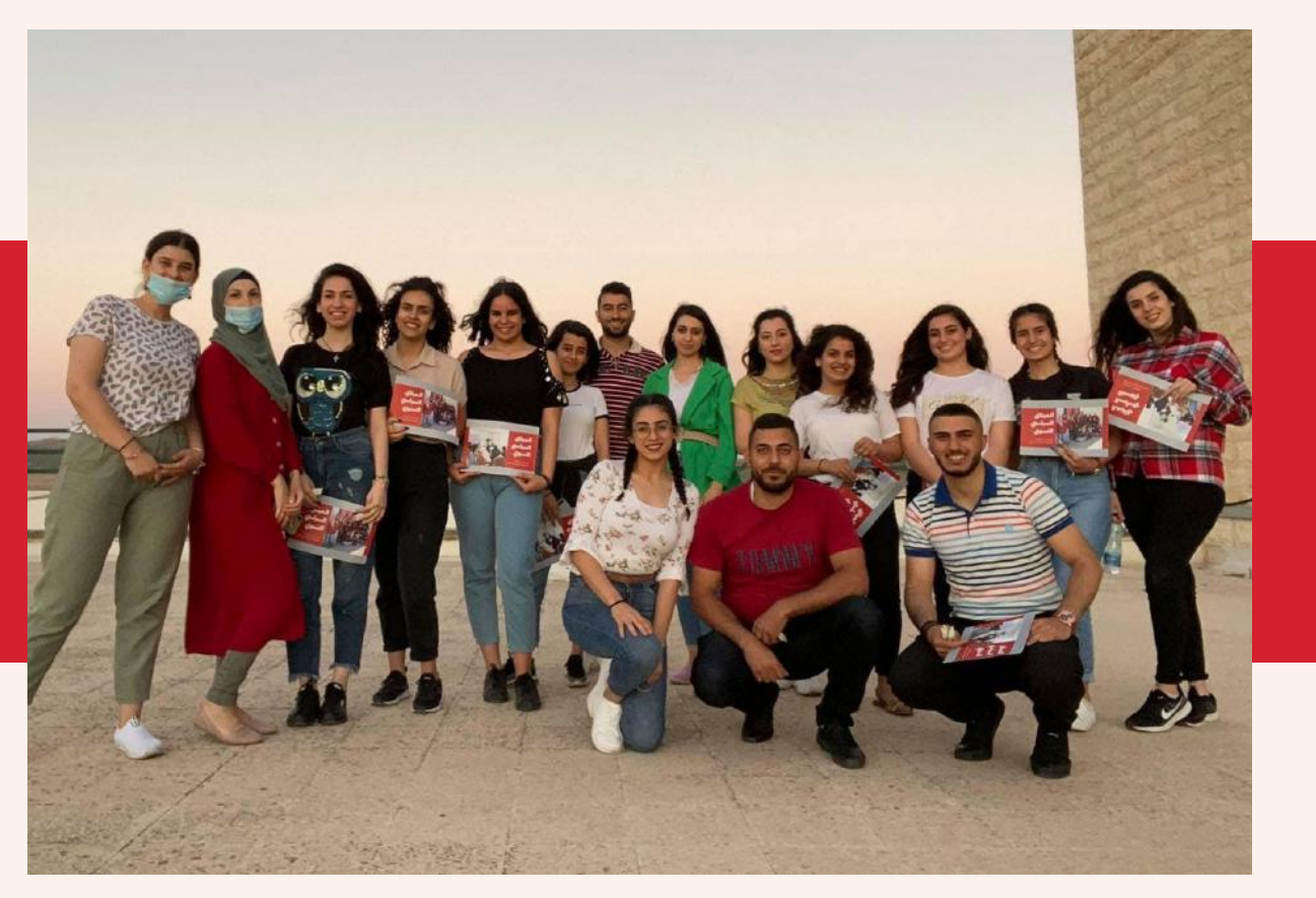
A group of supporters during one of the field initiatives