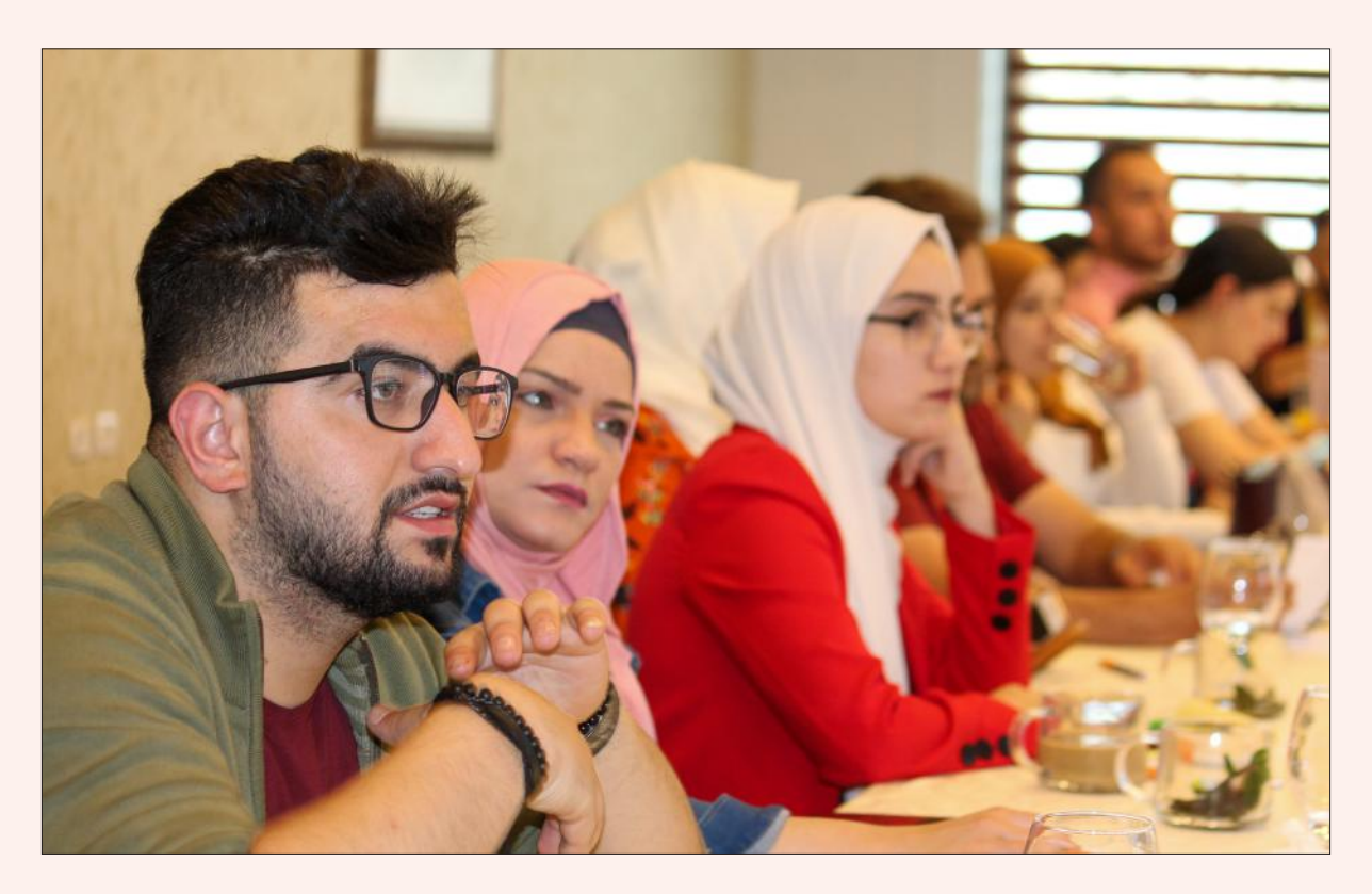
Youth in one of the training sessions

This cooperation between the parties provides a strategic added valued, the opportunity for mutual learning, regional exchange and enhanced capacity. Throughout this project, the PCPD along with 50 youth were able to produce a booklet on FoRB in Palestine and the peaceful mechanism to encounter discrimination.