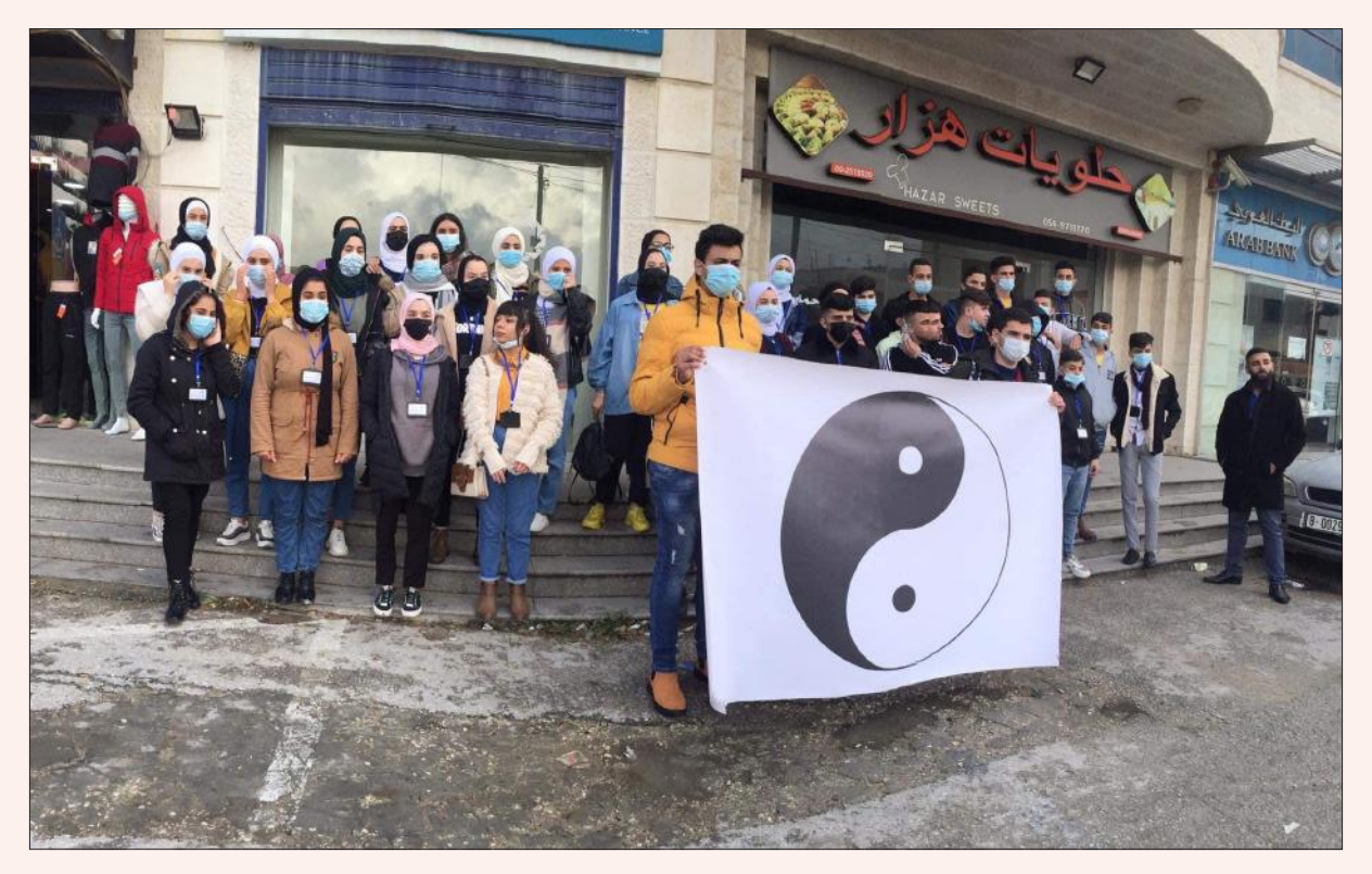
During one of the initiatives of the Integrity clubs in Salfeet under the title: White of Black

Under the Shine project, PCPD is keen to spread the principles of integrity between young students outside the school rooms. PCPD was able to reach to the most marginalized areas in the West Bank, including Salfeet and Tubas regions.